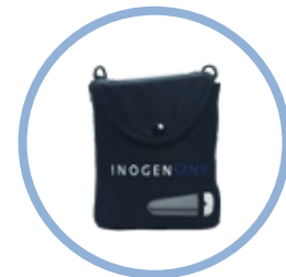
Inogen One ® G4 Carry Bag* Item # CA-400