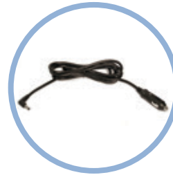
Inogen One ® G4 DC Power Cable* Item # BA-306