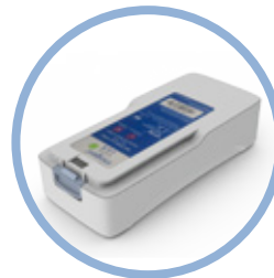
Inogen One ® G4 Extended Life Lithium Ion Battery** Up to 6 hours run time Item #BA-408