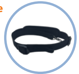
Inogen One ® G4 Carry Strap* Item # CA-401

Approximately half the size of the Inogen One G3!