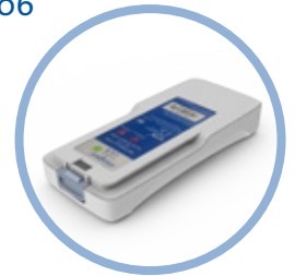
Inogen One ® G4 Lithium Ion Battery* Up to 3 hours run time Item #BA-400

Approximately half the size of the Inogen One G3!